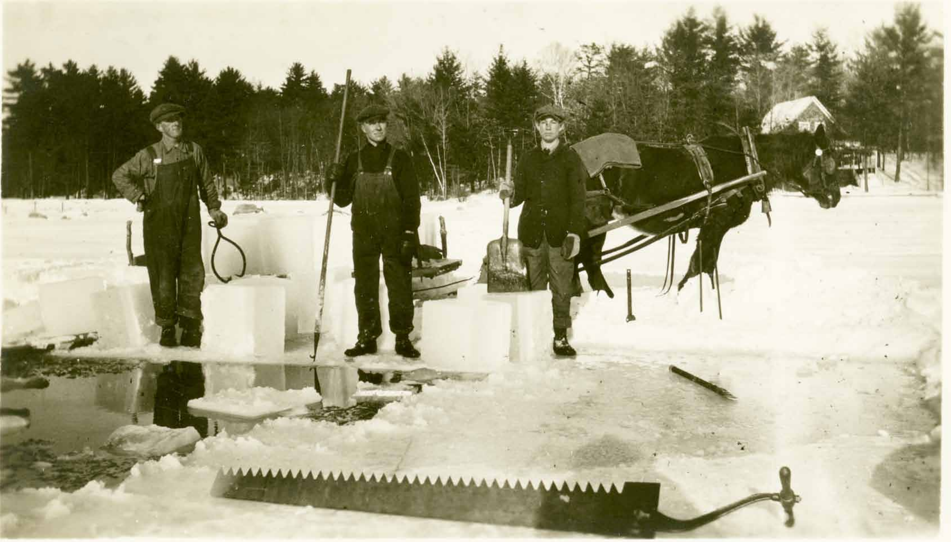
Three workers pose with thick blocks of ice on Sebago Lake circa 1920.