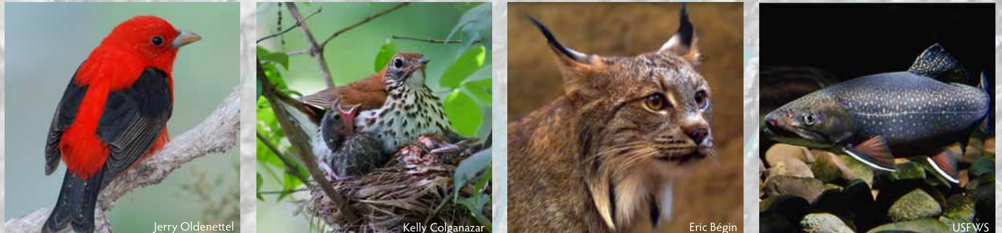
Left to right: Scarlet tanager, wood thrush (with young cowbird, a nest parasite), lynx, and brook trout are among the species in Maine that need interior forest habitat.