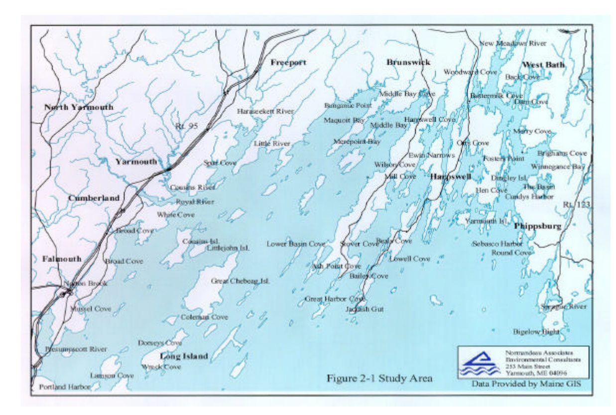
FIGURE 2-1. STUDY AREA