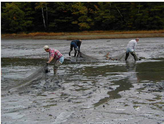
Covering the half of the plots with and without furrowing with net. The net protects small juveniles from predators.

Three plots measuring 28 X 25 feet were established in each town. One was for small clam seeding, one was for larger clams, and one was with no seeding at all. Half of each plot was covered with predator netting and the other half was left uncovered. Half of the plot was furrowed with a clam rake, with furrowing done perpendicular to the net, so that half of the netted area and half of the uncovered area were furrowed. Results will be based on the control plots with no seeding and natural conditions.