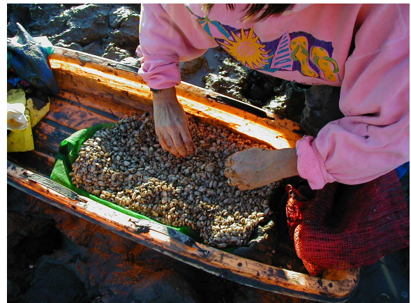
The size of the seeding clams ranges from small (8-10 mm) to large (18-20 mm). In the spring and fall 2002 the surviving clams will be counted and measured to

Management techniques vary significantly between municipalities within Casco Bay and between regions within the state. Most communities which define the shellfish resources to protect do have ordinances that define the responsibilities and goals of the shellfish committee, requirements of license holders, license fees and applicable state regulations. Most towns within Casco Bay do not restrict the amounts of clams that can be harvested per tide by Commercial License holders; all towns do have limits on Recreational diggers. Few municipalities allow nighttime digging, as this is especially difficult to enforce. Conservation time,