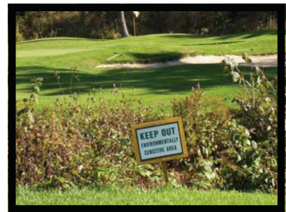
Sable Oaks Golf Club, S. Portland