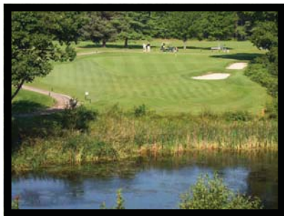
Portland Country Club, Falmouth

Project staff conducted eight technical visits to Casco Bay watershed courses and gave two formal presentations to larger groups which included Casco Bay watershed course superintendents and owners. Most of the technical assistance visits focused on courses that expressed interest or registered in the Audubon sanctuary program. The gold standard for golf course stewardship in the Casco Bay watershed has been set by Portland Country Club (see photo, below, left). Project staff toured the course with PCC staff to view all of the projects and measures implemented through the oversight of the Audubon program. PRW encouraged superintendents to follow the practices of the Portland County Club.