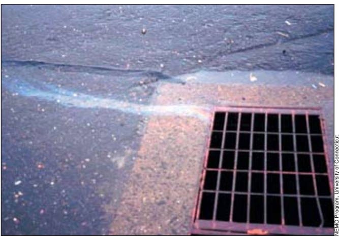
Impervious surfaces channel pollutants such as gasoline and oil into stormwater systems, which discharge into the rivers and streams flowing into Casco Bay.

Impervious surface coverage can be a useful indicator in predicting stream degradation. Recent studies suggest that the ability of Maine's streams to support aquatic ecological communities becomes degraded when the amount of impervious surface area exceeds 6%-10% of the overall watershed area (Morse 2001). Research by the Maine Department of Environmental Protection (DEP) supports this conclusion. In a study of the impact of urbanization on two Casco Bay watershed streams, Long Creek and Red Brook, sampling sites located in regions having impervious surface area coverage less than 7.0% had good water quality and biological community (e.g., fish, aquatic insects, crustaceans, etc.) conditions, while sites located in regions having coverage greater than 7.0% had poor to fair water quality and biological community conditions and, in some cases, failed to meet even state minimum water quality standards. Furthermore, sites with high impervious surface areas had high pollutant loads (e.g., metals, total suspended solids) compared with the reference site, Red Brook (Varricchione 2002). Additional DEP studies have found similar conditions within other streams in the Casco Bay watershed (Meidel et al. 2005)