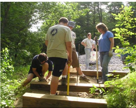
PRYCC crew members install infiltration steps on an eroding swimming hole access trail adjacent to a local road.