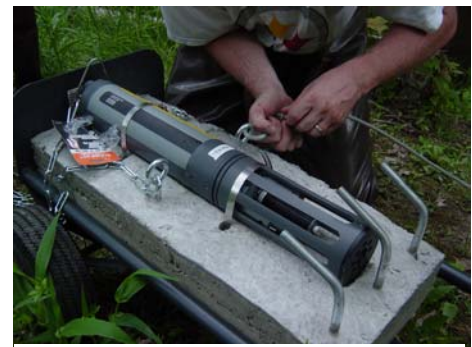
Presumpscot River Watch staff prepare to deploy a data sonde to monitor water quality in the Pleasant River.

Protecting & restoring the ecological integrity of the Casco Bay watershed