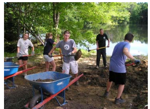
Presumpscot River Youth Conservation Corps members rebuild the canoe launch at Gorham's Shaw Park to prevent further erosion.