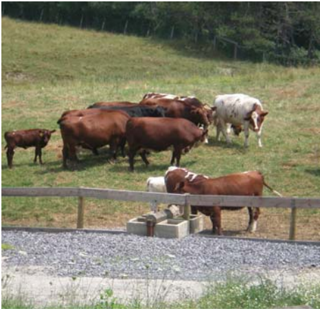
The new watering system for livestock on Walnut Crest Farm.