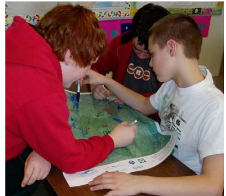
Students work with laminated maps as part of the Maps for Schools Program.