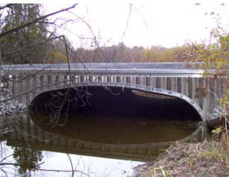
Totten Road crossing of Thayer Brook in Gray. Installation of a bottomless culvert pre- (above), and post- (below) installation.