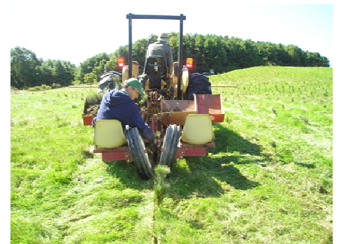
Walnut Crest Farm owner Dale Rines machine plants white and red pines on four acres of pasture along river. Livestock were fenced from the area to promote revegetation.