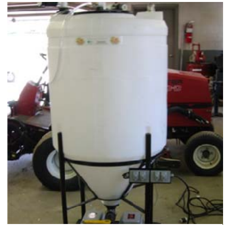
The new compost tea brewer at Falmouth Country Club.

The partnerships developed and strengthened through the PWI are having a lasting impact on water quality, habitat protection, and educational activities. For example, CBEP and partners are assessing road/stream crossings for barriers to fish passage; working to ensure that anadromous fish can pass Cumberland Mills Dam; and addressing sedimentation in the Pleasant River. Monitoring equipment is available on-loan from CBEP. Overall, the PWI has built local capacity to address environmental impacts; raised the public visibility of watershed issues; and helped to ensure that the Presumpscot River will continue to recover.