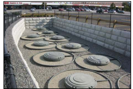
Mall Plaza stormwater control structures.