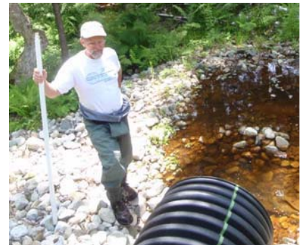
Casco Bay Watershed fish barrier assessment

CBEP has recently restored tidal circulation at the Thomas Cove saltmarsh. The project reduced the severity of a tidal restriction by replacing an undersized culvert under Adams Road (funded in part with NOAA restoration funds) thus reestablishing tidal activity to more than 22 acres of wetland. Project partners include the Town of Brunswick, the New Meadows Watershed Partnership and Maine’s Department of Transportation.