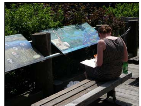
Bell Buoy Park waterfront exhibit, Commercial Street in Portland.

Protecting and restoring the ecological integrity of the Casco Bay watershed