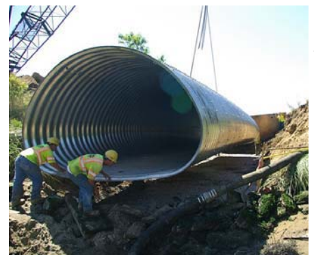
Adams Road pipe installation.