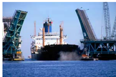
In 1996, the Julie N oil tanker spilled almost 180,000 gallons of fuel oil into the Fore River after striking the former Million Dollar Bridge while entering the harbor.

Butyltins: Toxic organometallic compounds, butyltins are molecules in which an atom of tin is bonded to carbon atoms in an organic molecule. Butyltins get into the Bay's sediments primarily from marine anti-fouling paints.