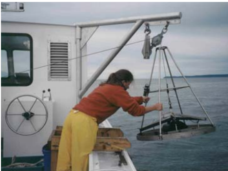
The Casco Bay Estuary Partnership and its partners sample Casco Bay sediment for the presence of toxic pollutants.

Sampling at several Casco Bay sites suggests that while there was an initial increase in lead levels from 1988 to 2002, there has been a decline in lead levels in more recent samples. A regional decline in lead over the past decade has also been observed in the mussel sampling program.