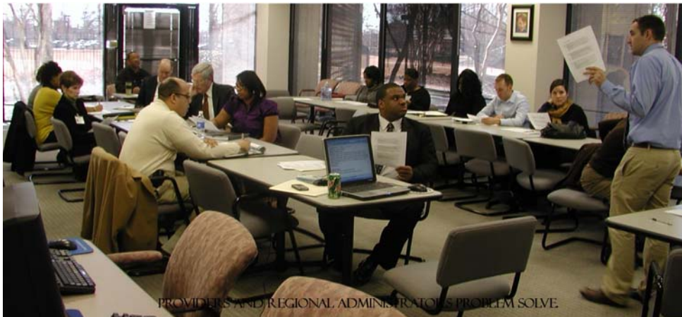
PROVIDERS AND REGIONAL ADMINISTRATORS PROBLEM SOLVE